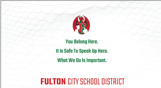
INTRODUCTION (LOGO REVEAL SCREENSHOT)