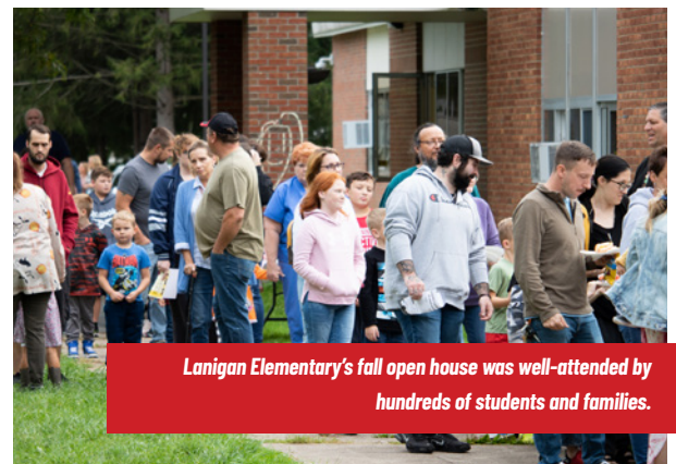
Lanigan Elementary's fall open house was well-attended by hundreds of students and families.

Stylized as "block parties," the events engaged students, parents and friends outside the buildings as much as inside. While traditional tours through each school still took place, essential community-building was occurring on the lawns and sidewalks. Both schools offered hot dog dinners to visitors – served by Volney and Lanigan staff – while several community and district organizations connected with families at tables outside. Organizations like the Fulton Fire Department, the Girl Scouts, the Boy Scouts, dance schools, athletics teams, and the CNY Arts Center were all in attendance at the schools, offering opportunities and resources to Fulton's youth. At Volney, it was also a night to showcase the Book Fair in the cafetorium. Both events were well-attended.